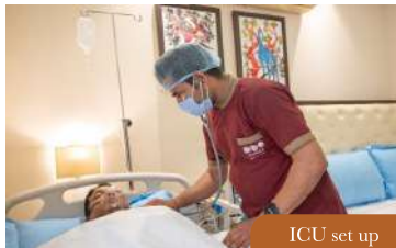
ICU set up