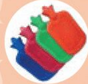
Hot Water Bottle