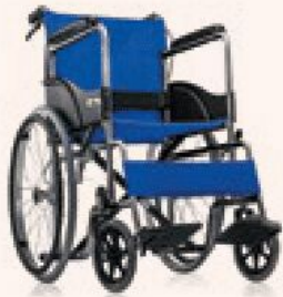
Premium Basic Wheelchair Product Code: MEPRWC1