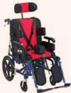
Cerebral Palsy Wheelchair-Adult Product Code: MECPCW2