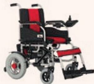
Basic Electric Wheelchair Product Code: MEEWC01