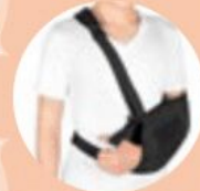
Shoulder Arm Support