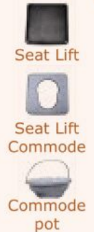
Wheelchair with Seat Lift Commode Product Code: MECW02