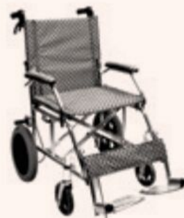
Transit Wheelchair Product Code: METW05